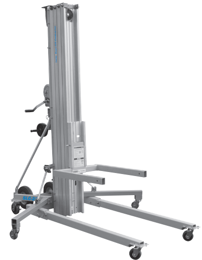
(1) Available aftermarket only